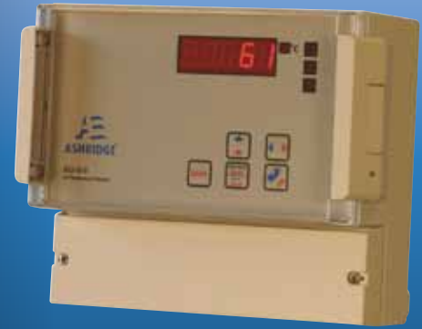
Wall Mounted Version