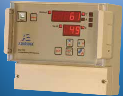
Wall Mounted Version