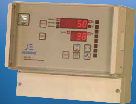
Wall Mounted Version